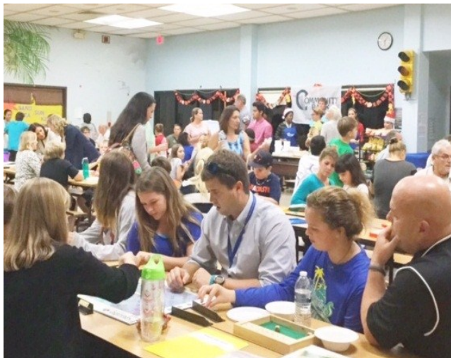
Students, teachers, and parents enjoyed playing math games and browsing the STEM fair projects.