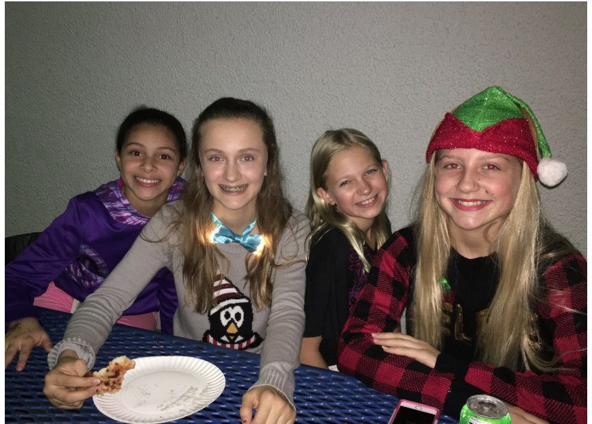
6th-8th graders enjoyed the music and pizza at the PKS dance.